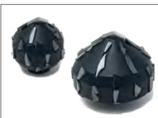
Diamond cone-cylinder milling tool - with carbide-tip, asymmetrical segments - Field of application: Opening of laterals and inlet lines

Kardiam-BLACK-POWERLINE® Not for steel-reinforced concrete!