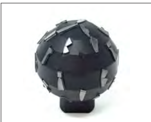
Diamond globe milling tool - asymmetrical segments - Field of application: Opening of laterals and inlet lines

Kardiam-BLACK-POWERLINE® Not for steel-reinforced concrete!