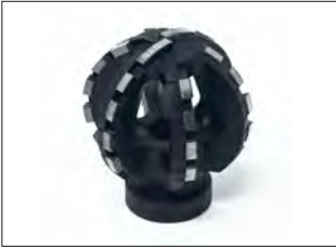
Diamond globe milling tool - transparent - Field of application: Opening of laterals and inlet lines

Milling tools suitable for CIPP, PVC and ROOTS