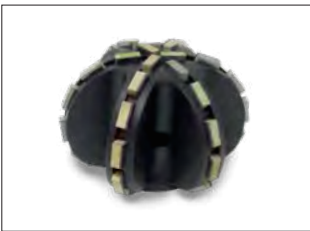
Diamond globe milling tool - transparent - Field of application: Opening of laterals and inlet lines

Kardiam-BLACK-POWERLINE® Not for steel-reinforced concrete!