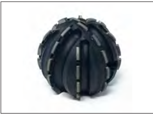
Diamond globe milling tool - with chip run-off grooves, smooth running cut - Field of application: Opening of laterals and inlet lines

Kardiam-BLACK-POWERLINE® Not for steel-reinforced concrete!